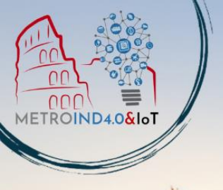
Exhibit Space & Sponsor - Application/Contract

Application is hereby made to IEEE MetroInd 2021 (hereinafter termed "Exhibit Management") for virtual exhibit space at the above named conference. This Application when accepted by Exhibit Management, together with the Exhibition Rules and Regulations as listed on the following pages, will constitute your contract with Exhibit Management for exhibit space, as indicated by the Conference Manager signature on this Application or acknowledgment by email.